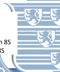
Ski Italy 2025