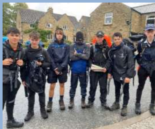
Duke of Edinburgh – Silver Award Assessed Expedition