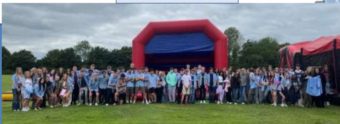
Year 11 students