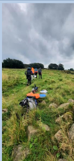
DofE students braving the weather in the Derbyshire Peak District for their Silver Assessment weekend.