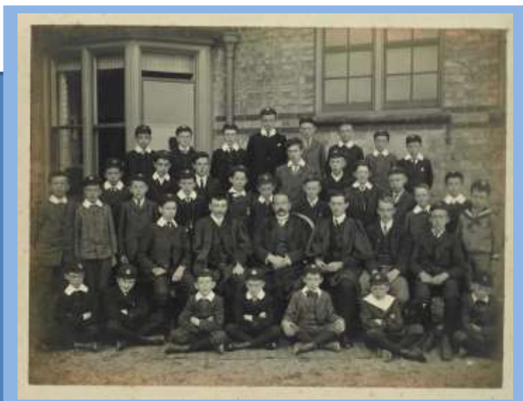
Whole School Photo c1900