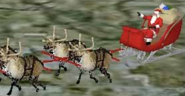
Streetsville, Ontario, Canada

ous emails and “tweets” from all over the globe.