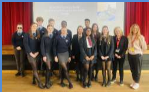
Years 12 and 13 Psychology students attending a lecture by the University of Lindon